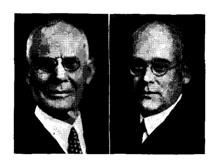
. . . They found no heresy

set forth in its Constitution: a Church composed of Protestant freemen in Christ Jesus. A Church whose supreme law is the Bible, whose only Head is Christ. A Church that refuses to attempt to put its own word on a parity with the Word of God written. A Church which abides by its Constitution when that document declares that "all church power . . . is only ministerial and declarative; that is to say, that the Holy Scriptures are the only rule of faith and manners; that no church judicatory ought to pretend to make laws, to bind the conscience in virtue of their own authority; and that all their decisions should be founded upon the revealed will of God." (Form of Government, Chapter I, Sec. VII.) A Church that abides by its Confession of Faith when it declares that "It belongeth to synods and councils, ministerially, to determine controversies of faith, and cases of conscience; to set down rules and